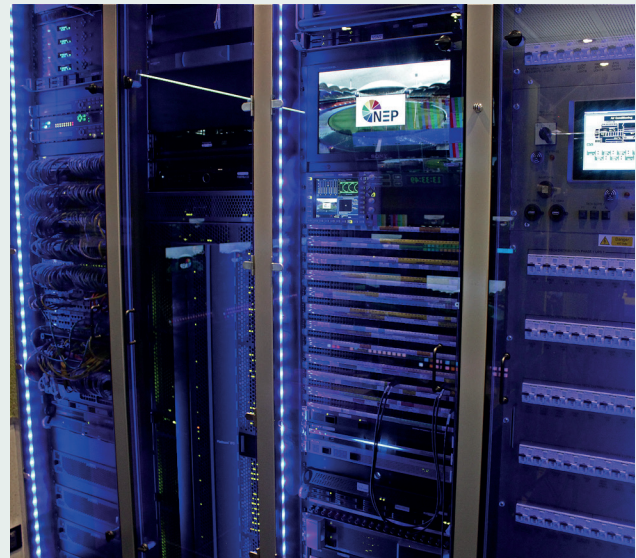
NEP's OB Supertruck HD12: Tech Racks

With instant switching, no visible video latency or artefacts and freedom to select any connected devices at will, the Draco tera KVM switch contributes greatly to the overall working efficiency of the vehicles.