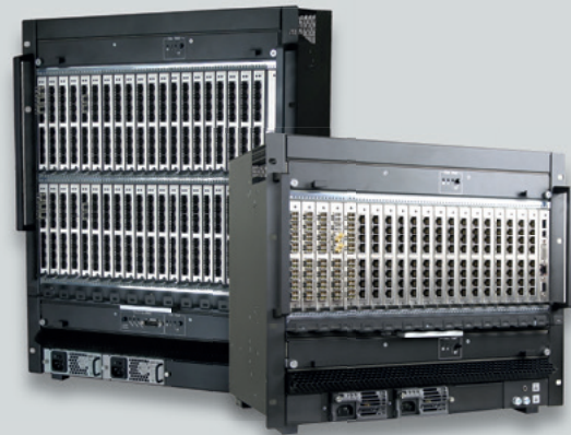
The Draco tera matrix system. Available in a range of sizes from 8 to 576 ports.