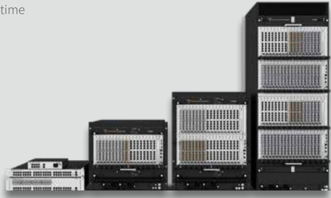
The Draco tera matrix system. Available in a range of sizes from 8 to 576 ports.