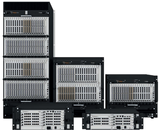
IHSE Draco tera Matrix Switch

One of the most important benefits lies in the ability of users to select and instantly connect to any of a set of connected computers, at will and without limitation. This means that any user can operate any computer system without having to move location. Crucially it is a direct connection that does not suffer the inconvenience or lag associated with IP connectivity. In the stressful, busy environment of live gaming and broadcasting that is a tremendous advantage.