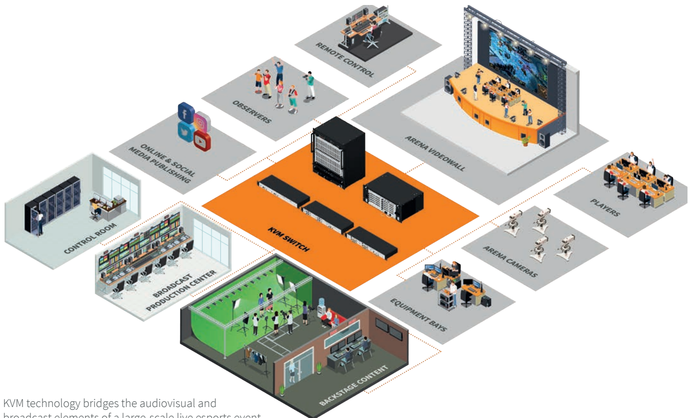
KVM technology bridges the audiovisual and broadcast elements of a large-scale live esports event.

Then there is the broadcast element of the event. Live broadcast programming is produced and fed to online streams and sometimes traditional over-the-air broadcast. This includes live action, player and audience shots, commentary and slow-motion replays. Gaming streams are passed to generic broadcast equipment to create these productions. Our technology has been a fundamental part of the infrastructure of numerous broadcast studios and outside broadcast trucks for many years and is used widely to manage, access and control the broadcast workflow. So this is an extension of what we already do.